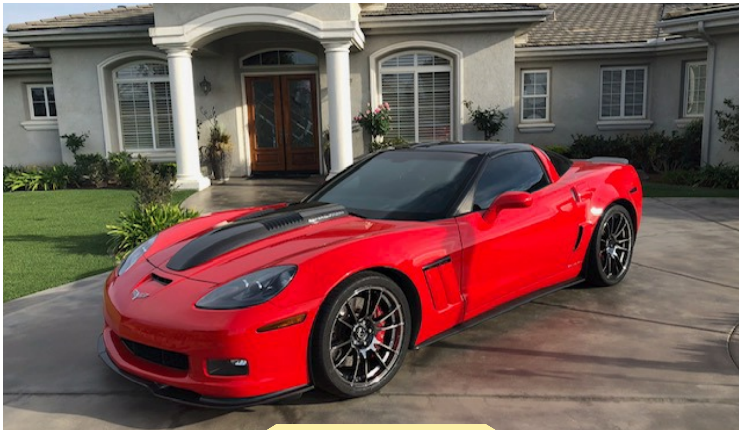
“Little red Corvette Baby you’re much to fast!”

What’s Inside: President’s Corner Board of Directors Club Events Calendar About Our Club